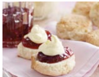
(Scones, jam, cream, tea, coffee provided)